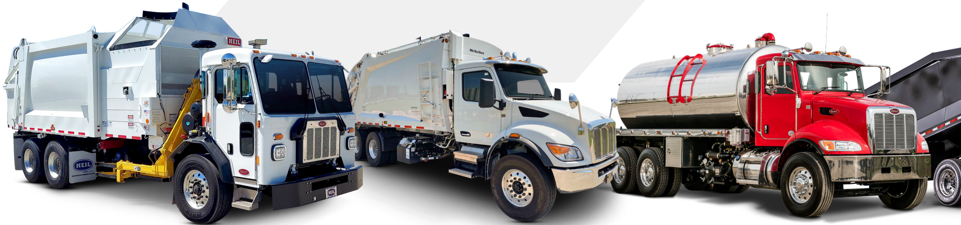
AUTOMATED SIDE LOADERS