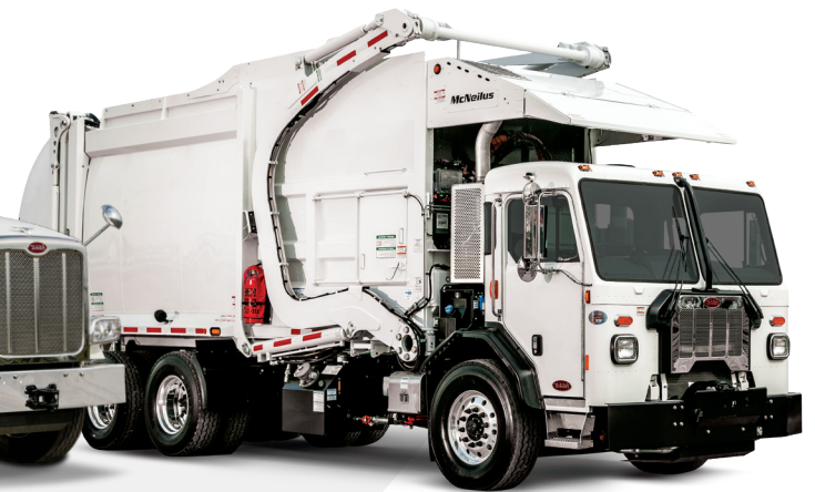
FRONT END LOADERS